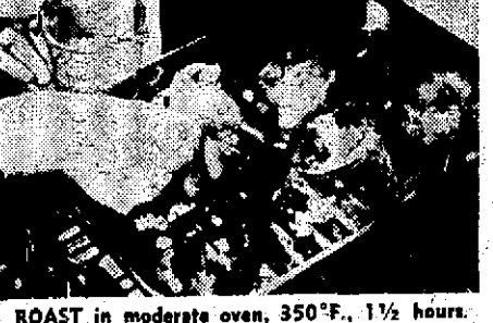
HAVE spareribs cut in serving sizes. Place in shallow baking pan. Dust with salt, pepper, MSG. ROAST in moderate oven, 350°F., 1 1/2 hours. Baste with Barbecue Sauce twice in last hour.