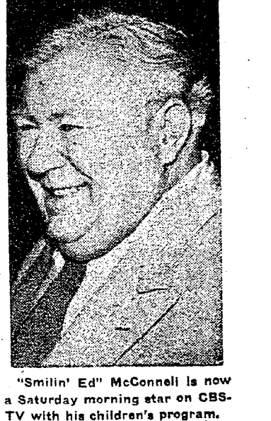
'Smilin' Ed' McConnell is now a Saturday morning star on CBS-TV with his children's program.