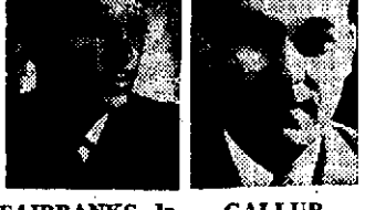
FAIRBANKS, JR. GALLUP

* Starring programs are also carried on corresponding FM stations... FM channels WIBA-FM 101.5 M. WWCW (WIBU) 94.9 M. WISC-FM 88.1 M.