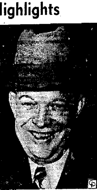
GEN. DWIGHT D. EISENHOWER

11:45 a. m. — Ranch Hands (WIBA): "Moon Over Montana," "Durang's Hornpipe," "Missouri,"