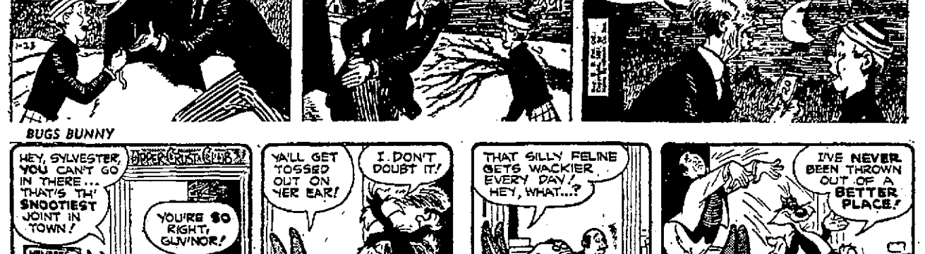
By GUS EDSON