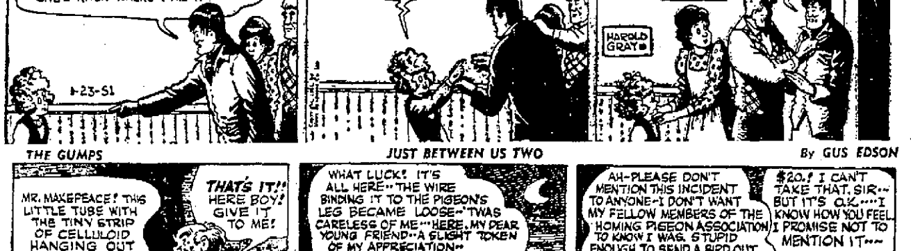
By GUS EDSON