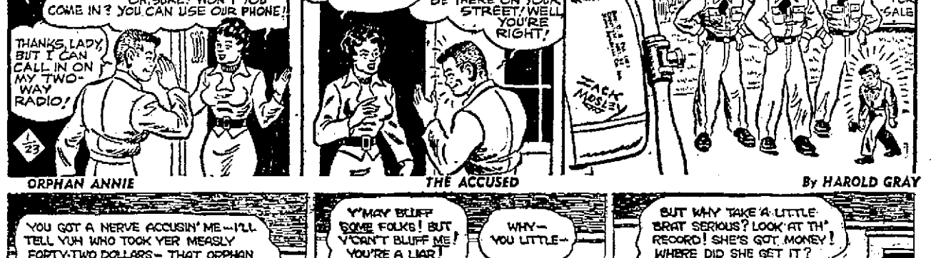
By HAROLD GRAY