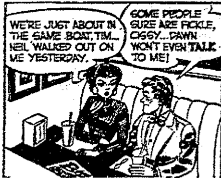
TERRY AND PIRATES