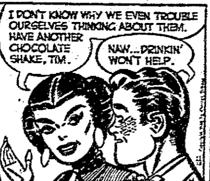
CHATTER IN THE NIGHT