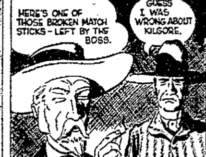
SEE ARCHIE IN BIG SUNDAY EXPRESS COLORED COMIC SECTION