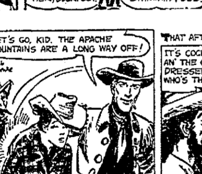
RETURN TO YESTERDAY