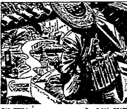
By DAN SPIEGEL