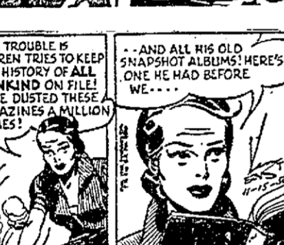
THE APPLE OF HER EYE