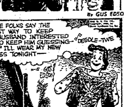
By GUS EDSON