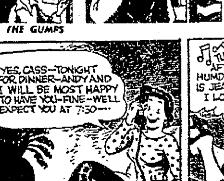
By GUS EDSON