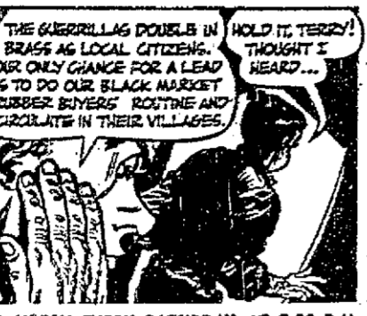
HEAR HOPPY EVERY SATURDAY AT 7:30 P.M. ON KFTA