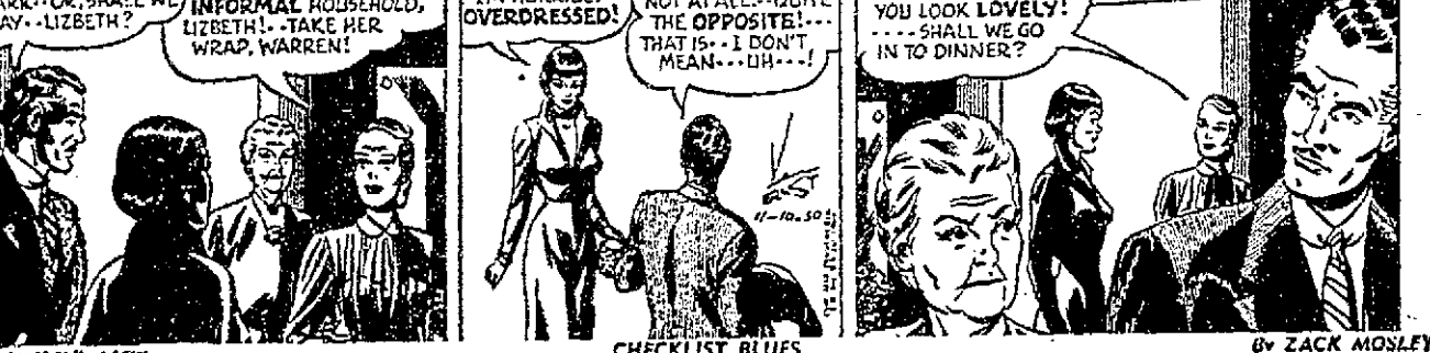
CHECKLIST BLUES By ZACK MOSLEY