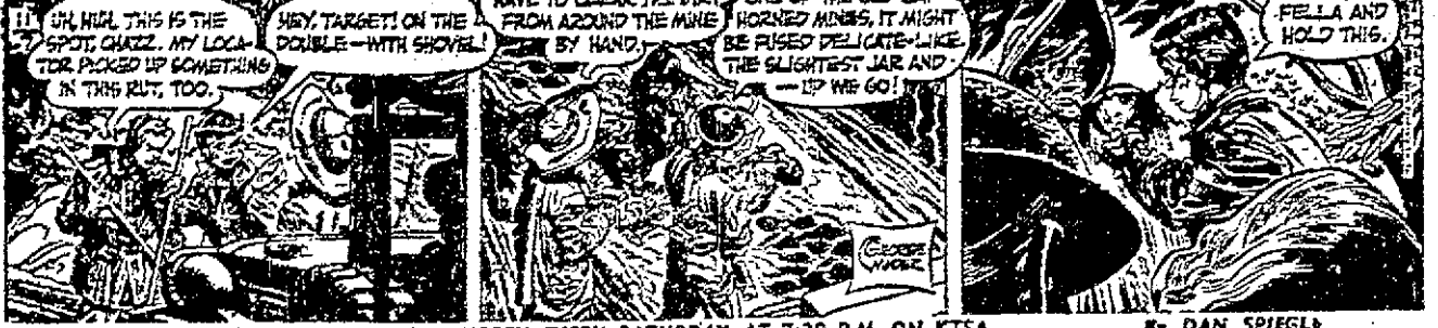
HOPALONG CASSIDY HEAR HOPPY EVERY SATURDAY AT 7:30 P.M. ON KTSA