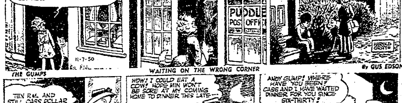
ANDY GUMP! WHERE HAVE YOU BEEN?