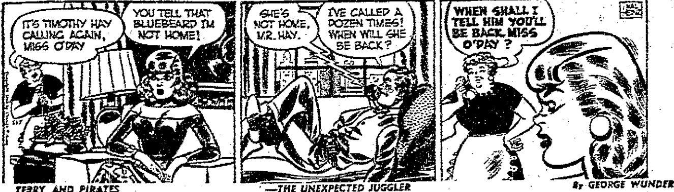
TERRY AND PIRATES THE UNEXPECTED JUGGLER