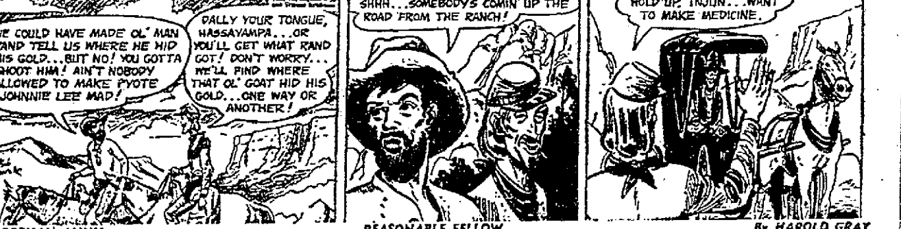
ORPHAN ANNIE By HAROLD GRAY