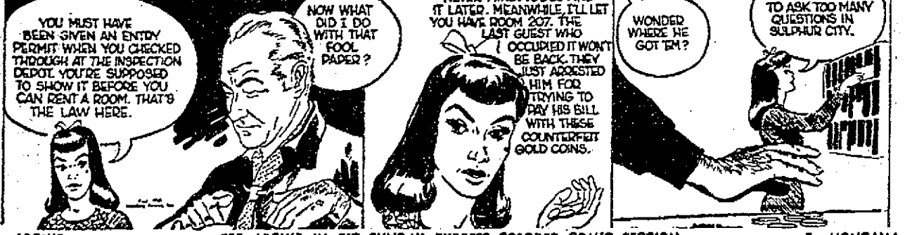
ARCHIE SEE ARCHIE IN BIG SUNDAY EXPRESS COLORED COMIC SECTION By MONTANA