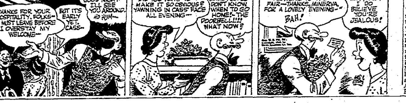
THE GUMPS By GUS EDSON