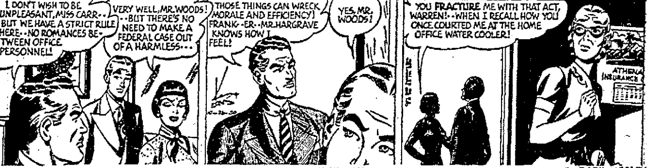
SMILIN' JACK ALWAYS WRONG By ZACK MOSLEY