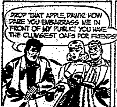
TERRY AND PIRATES