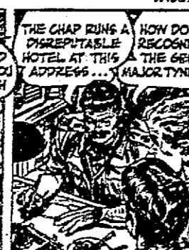
HEAR HOPPY EVERY SATURDAY AT 7:30 P.M. ON KTSA