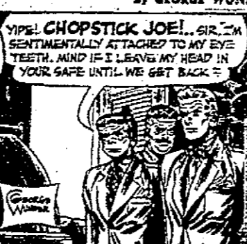
By DAN SPIEGEL