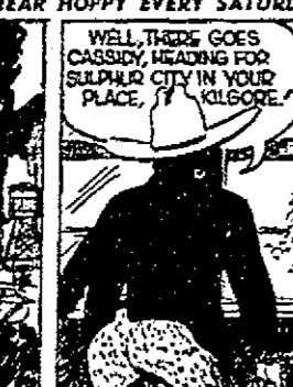
SEE ARCHIE IN BIG SUNDAY EXPRESS COLORED COMIC SECTION