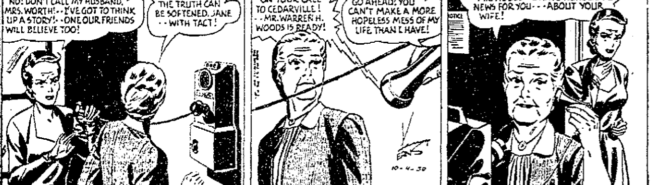
SMILING JACK By ZACK MOSLEY