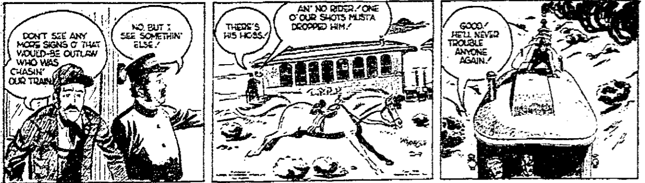
ARCHIE SEE ARCHIE IN BIG SUNDAY EXPRESS COLORED COMIC SECTION By MONTANA