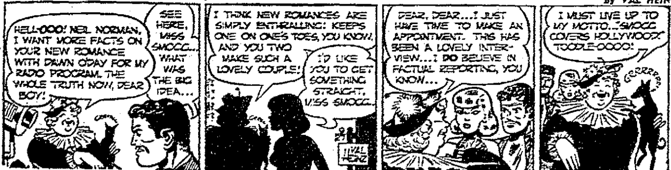
TERRY AND PIRATES