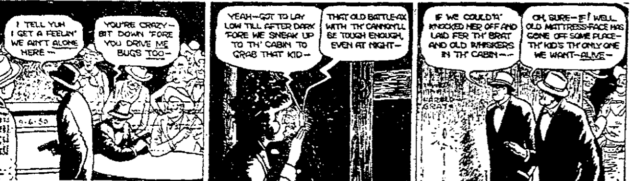
THE GUMPS HEADING FOR TIM'S By GUS EDSON