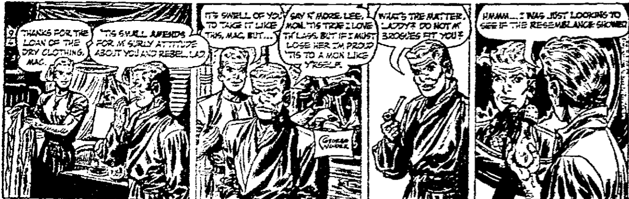
HOPALONG CASSIDY AMERICA'S FAVORITE COWBOY By DAN SPIEGEL