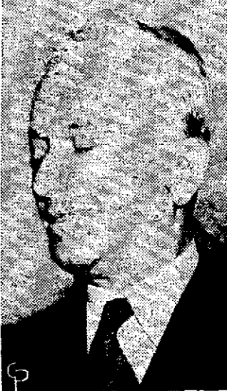
BENEGAL N. RAU

against the background of Jacob Malik talking into a television microphone at a session of the United Nations. The New York-to-Chicago network cost $12,000,000 to build and provides additional service to such intermediate points as Pittsburgh, Johnstown, Pa., Cleveland, and Toledo, O. The radio beam is sent across the country with a transmitter power of only 1/2 watt, about the same power needed to operate a small flashlight. A highly efficient metal lens is used to obtain the signal and if it were not used it would take a transmitter of 25,000,000 watts to produce the signal.