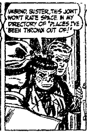
AMERICA'S FAVORITE COWBOY