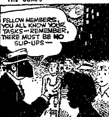
THE LEADER STAYS BEHIND