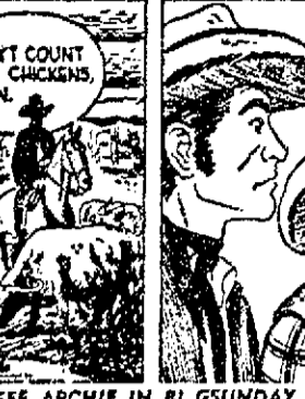
SEE ARCHIE IN BI GSUNDAY EXPRESS COLORED COMIC SECTION