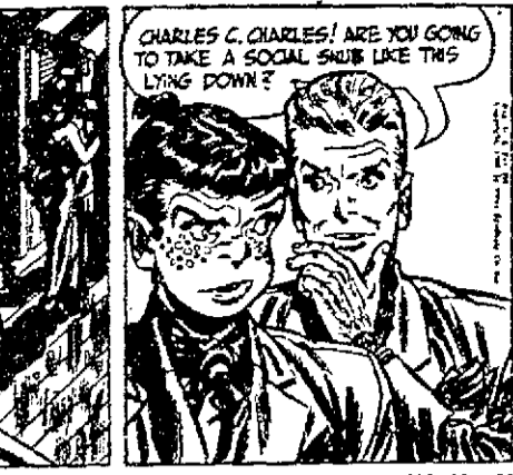
By DAN SPIEGEL