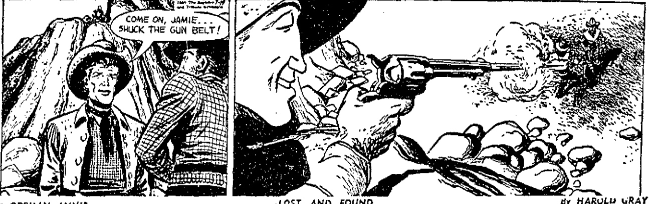
ORPHAN ANNIE LOST AND FOUND By HAROLD GRAY