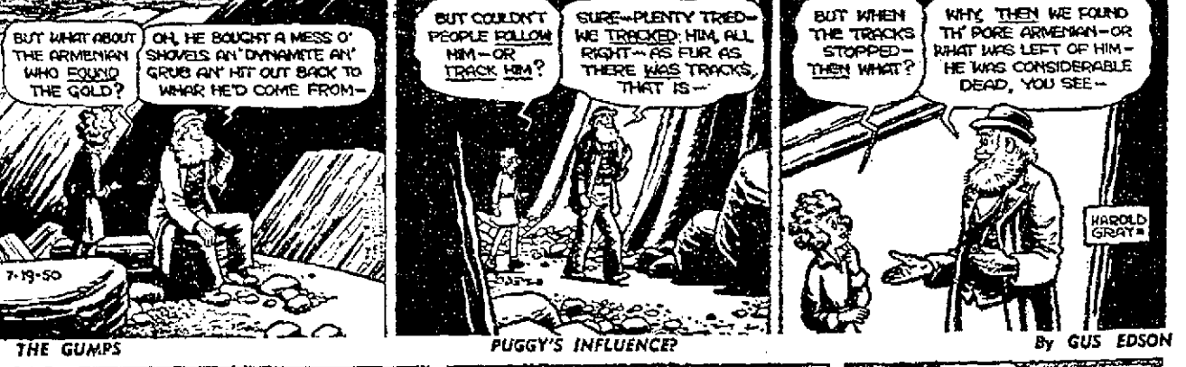
THE GUMPS PUGGY'S INFLUENCE By GUS EDSON