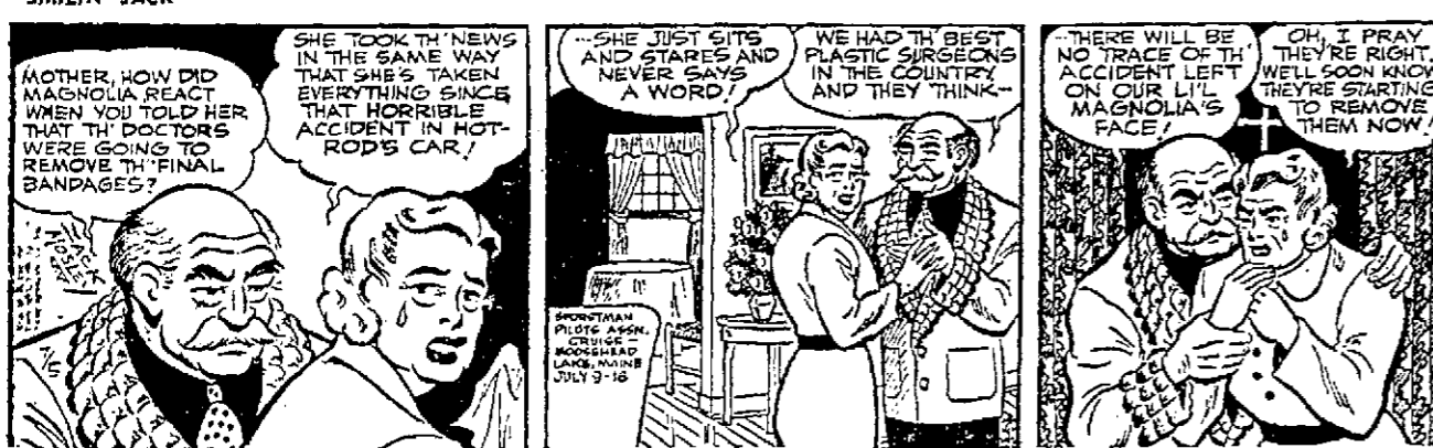
LAREDO CROCKETT ORPHAN ANNIE