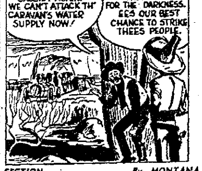
THEY CAN'T TOUCH YOU