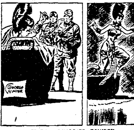
RECOGNITION AT LAST