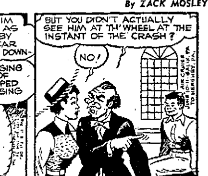
MR. BANDIT IS HOLDING THE BAG