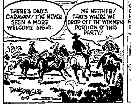
AMERICA'S FAVORITE COWBOY