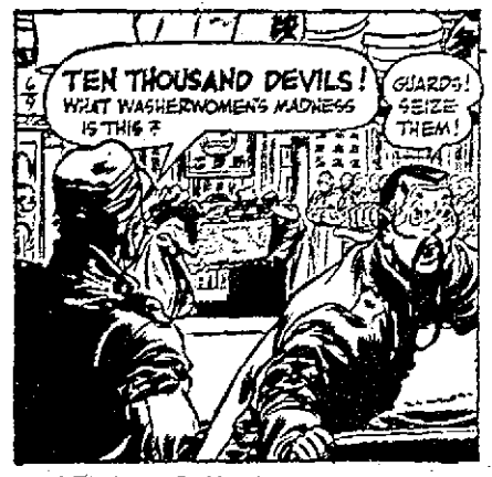
TERRY AND THE PIRATES