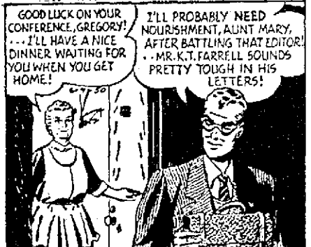
RACK UP ONE FOR HOT-ROD