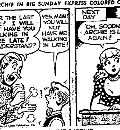
SEE ARCHIE IN BIG SUNDAY EXPRESS COLORED COMIC SECTION