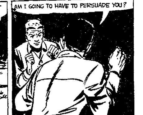
By HAROLD GRAY