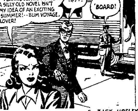
By ZACK MOSLEY