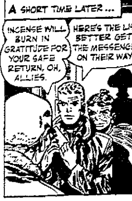
By DAN SPIEGEL