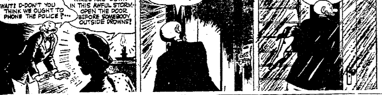
THE GUMPS VISITOR By GUS EDSON