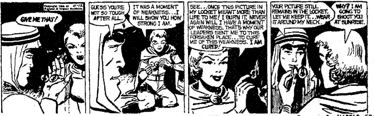
By HAROLD GRAY