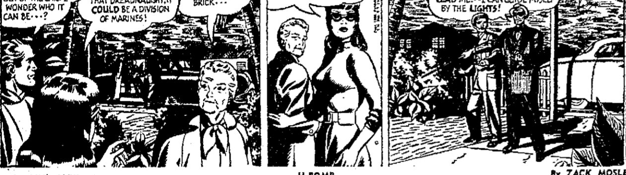
By ZACK MOSLEY