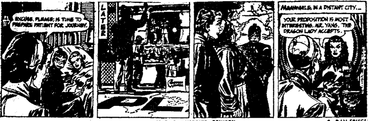
By DAN SPIEGLE