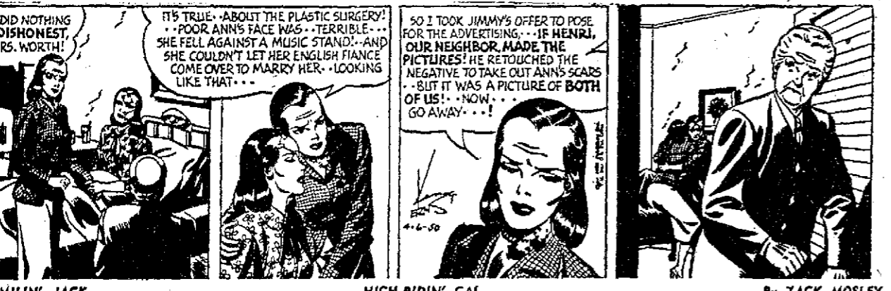
SMILIN' JACK HIGH-RIDIN' GAL By ZACK MOSLEY