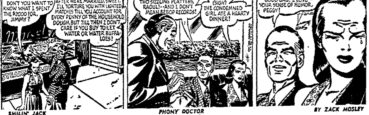
SMILIN' JACK PHONY DOCTOR