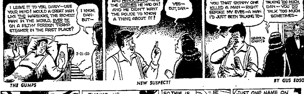
THE GUMPS NEW SUSPECT!