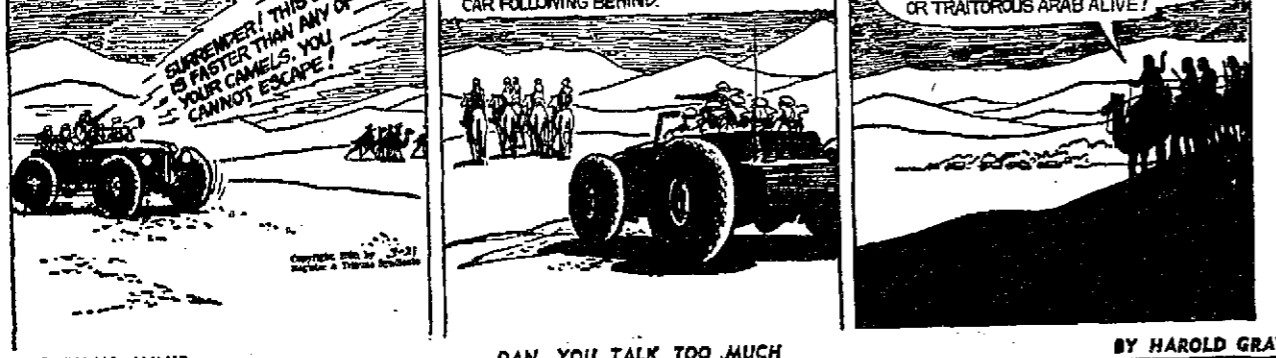
ORPHAN ANNIE DAN, YOU TALK TOO MUCH