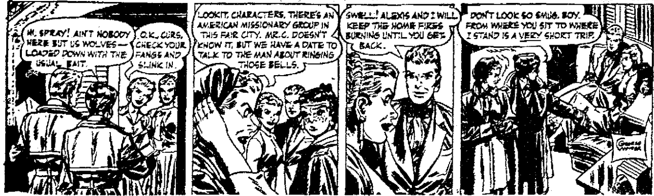
HOPALONG CASSIDY BY DAN SPIEGEL