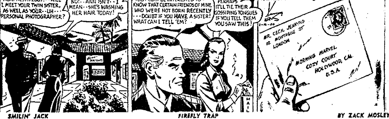
SMILIN' JACK FIREFLY TRAP BY ZACK MOSLEY