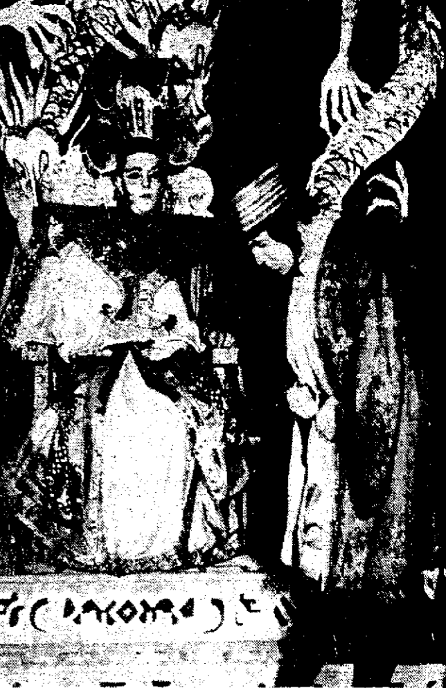
POLO AND THE KHAN—The daring adventures of Marco Polo will thrill youngsters from the stage of Municipal Auditorium Thursday. Here are the Kublai Khan and Polo in a scene from "Adventures of Marco Polo," presented by the Clare Tree Major Children's Theater.

Young Marco, leaving his snug Venetian home to plunge into the ancient wilderness, must have been as bewildered as someone today would be if projected out of the solar system and left to wander half blinded among the stars.