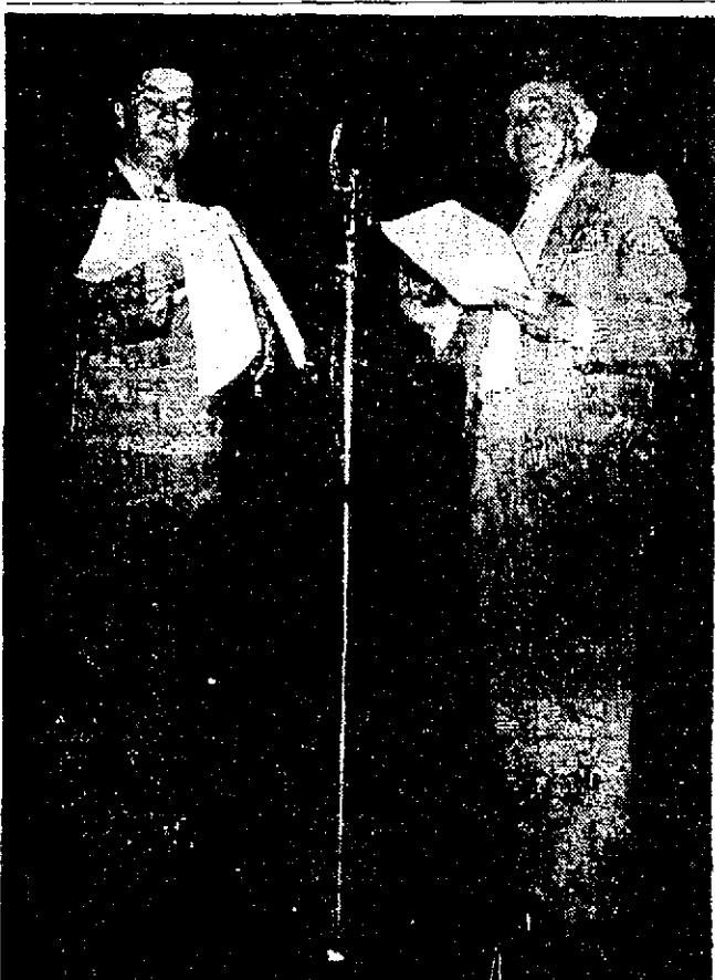
VISITOR—Al Jolson, CBS singing star and wit, tangles with peppery Charlie McCarthy and his fellow dummy Mortimer Snerd, when he visits their boss, Edgar Bergen, on KTSA-CBS' "Edgar Bergen-Charlie McCarthy Show" Sunday.

*Carried also on KTSA-FM 101.5 mc on Your FM Dial