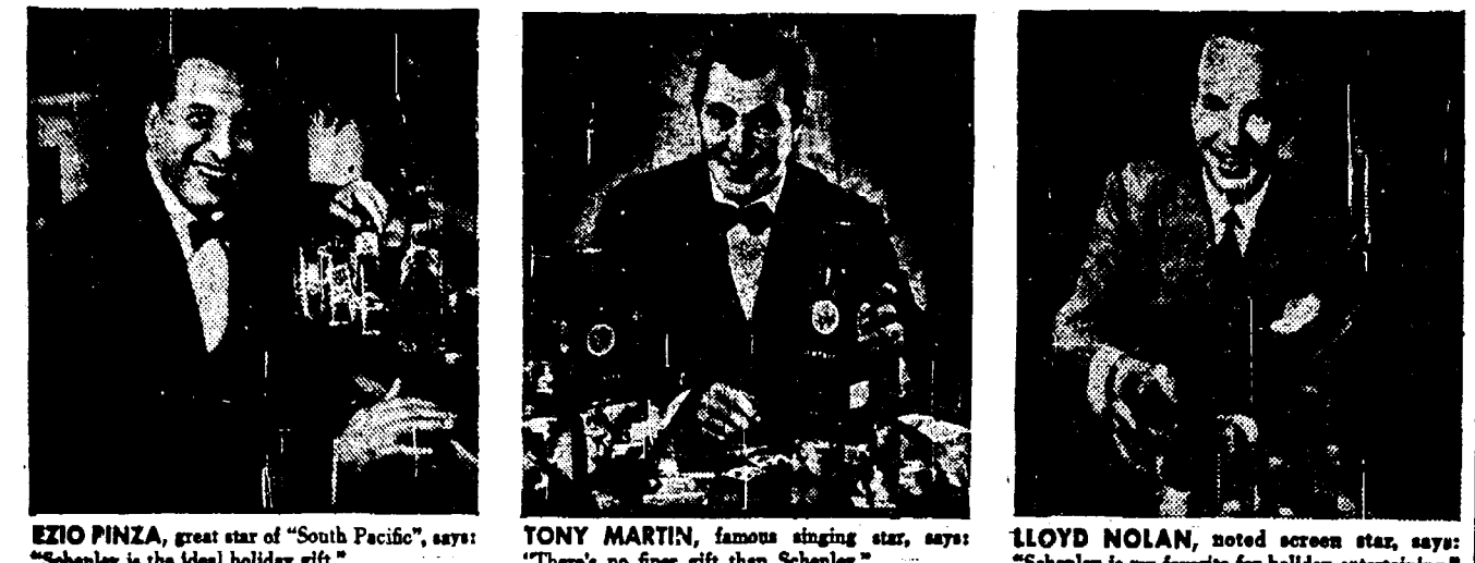
EZIO PINZA, great star of "South Pacific," says: "Schenley is the ideal holiday gift." TONY MARTIN, famous singing star, says: "There's no finer gift than Schenley." LLOYD NOLAN, noted screen star, says: "Schenley is my favorite for holiday entertaining."