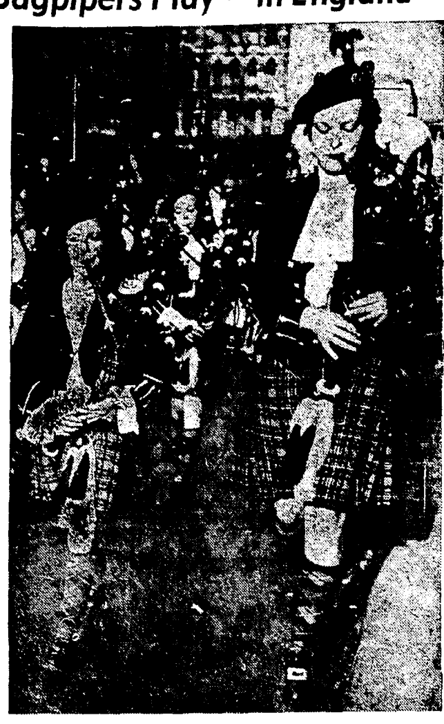
These girl bagpipers are marching in London, England, where they gave a concert. Their average age is 14, and they came 700 miles from Scotland to play their music.