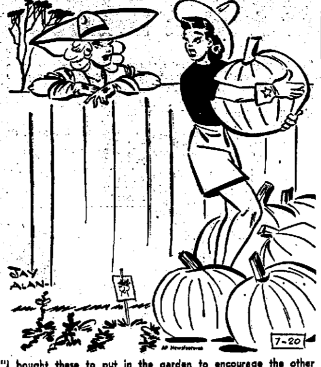
"I bought these to put in the garden to encourage the other vegetables!"

Q. Are official Weather Bureau temperatures always taken in the shade? A. L. A. Official temperatures are taken in the shade. Weather Bureau observers place their thermometers in a raised box with louvers so that air can pass through freely.