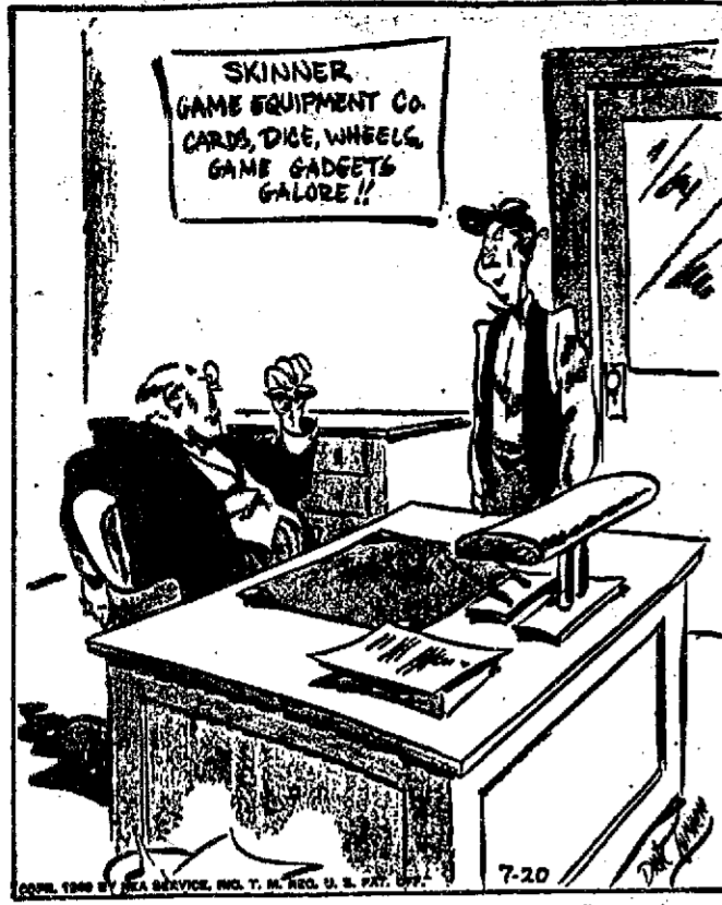
"About that raise you mentioned, Broadstreet—I'll match you double or nothing!"