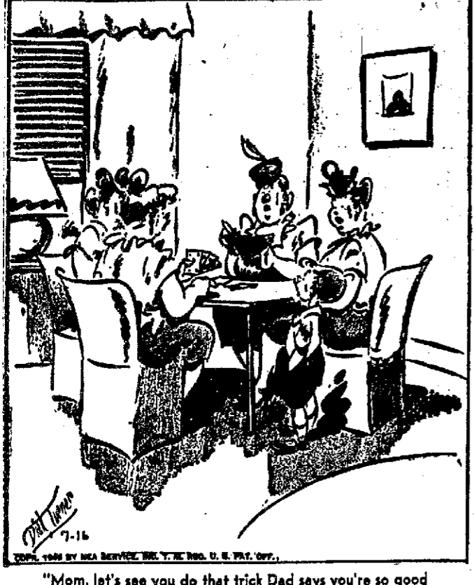
"Mom, let's see you do that trick Dad says you're so good at—making the jack disappear!"