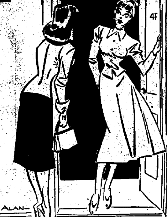
"I'm your new neighbor, so I stopped in to see what you have, that I don't have, and might want to borrow some day."

A. The first heavyweight championship fight televised was the Louis-Cornett fight, which took place on June 19, 1946.