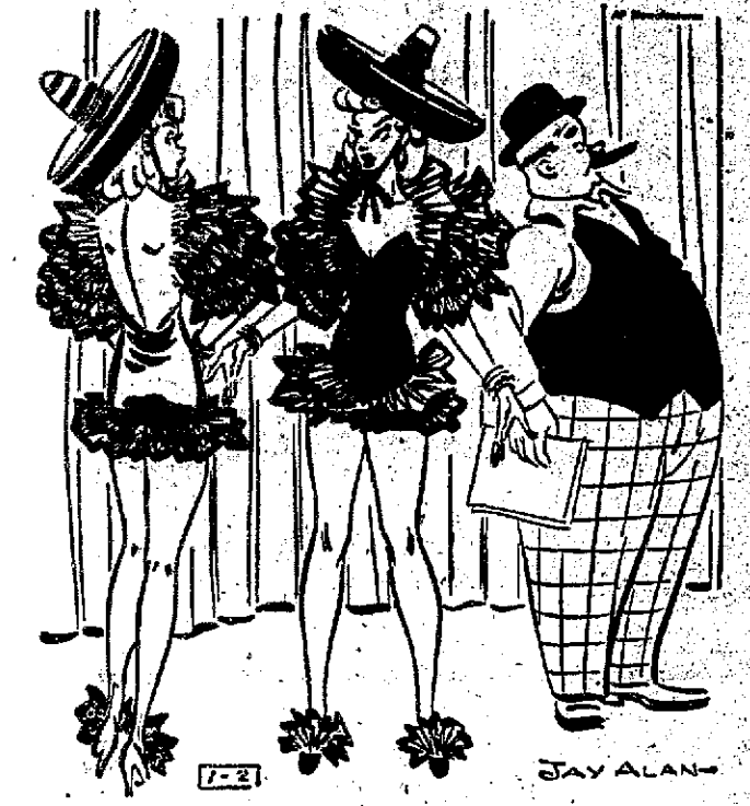
"He's an artist all right, he always turns out the most artistic flop of the season!"