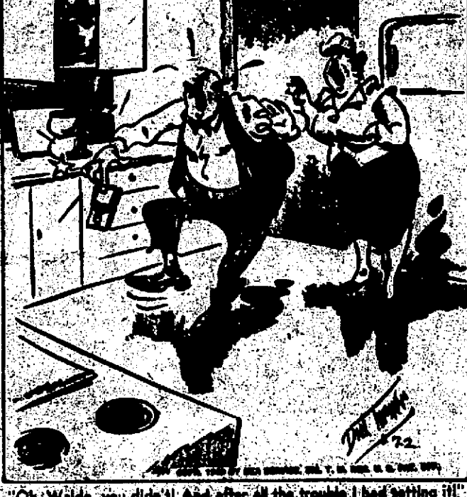
"Oh, Wally, you didn't! And after all the trouble I had getting it!"