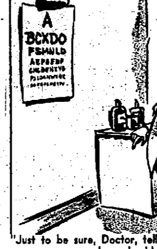
"Just to be sure, Doctor, tell him the last line is something little boys shouldn't be interested in!"