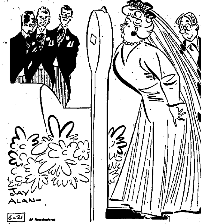
"If she weighs over 190 pounds, the match is off!"

A. The longest stretch of continuous rails ever welded in the United States measured 34,056 feet on the former Denver & Salt Lake Railway.