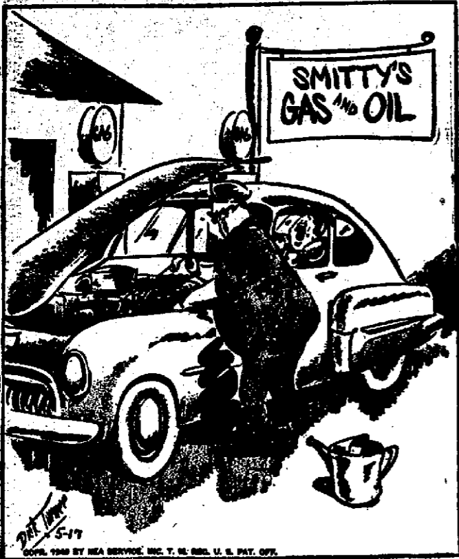
"Could you put in a new wick or something so it won't burn so much oil?"