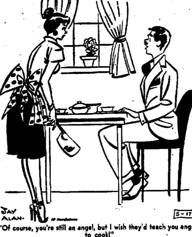
"Of course, you're still an angel, but I wish they'd teach you angels to cook!"

A. Relationship between husband and wife, as well as that of others through marriage, is affinity.