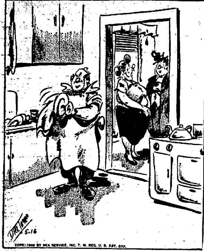
"Waldo and I make a game out of doing the dishes—I'm the referee!"