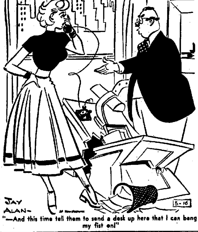
"—And this time tell them to send a desk up here that I can bang my fist on!"

A reader can get the answer to any question by writing to the Press-Telegram Information Bureau, 318 E. St., N. E., Washington 2, D. C. Please enclose three (3) cents for return postage. Q. Where did the uranium ore that was sent from the United States to Madame Curie, come from? R. E. Z. A. Several tons of uranium-bearing ore obtained near Natavita, Montrose County, Colorado, were shipped to Paris in 1898 and used by Madame Curie in the extraction of the element radium. Q. What kind of beard is an imperial? N. P. D. A. A tuft of hair on the chin with all the rest of the beard and all the whiskers shaved off is called an imperial because the Emperor Napoleon III set that fashion. Q. What cow is the world's champion milk producer? C. C. A. A British Friesian holds the present record of 45,061 pounds, according to the Department of Agriculture. Her name is Bridge Birch. The American record is held by Carnation Ormsby Madcap Fayne 1639621, with 41,943 pounds of milk.