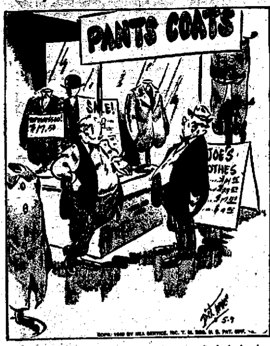
"If you care to investigate, you'll find that we outfit the husbands of some of the best-dressed women in town!"