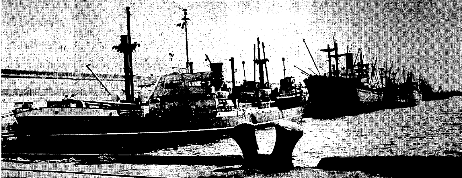
NEW L. B. TERMINAL CROWDED—An example of the commercial activity at the new huge transit shed, outer Long Beach Harbor, is pictured here, with ships occupying all the space from Berths 5 to 10. In the foreground is the Canadian freighter Taxis, here topping off cargo for the Far East with two former subchasers on deck; States (Quaker) Line's Montana, loading a vast amount of Army and general cargo for the Orient; Calmar Line's freighter Seamar, putting down steel from Pennsylvania; Sain-Staugen Line's motor freighter Shauvann, discharging cargo from the Orient, and Isthmian's Zane Grey, waiting to load pipe for the Persian Gulf.