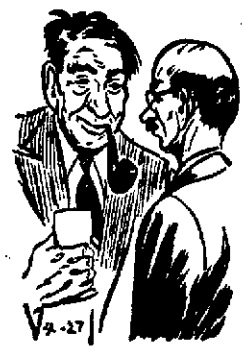
It was a mistake to tell Ma's sinful Uncle Joe he couldn't take his money to heaven. He's doing his level best to get to the other place with it.