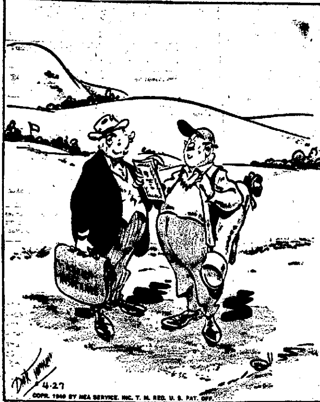
Now this policy pays off on all illness arising from accidents—for instance, today you get a hole-in-one, tomorrow you get laryngitis!