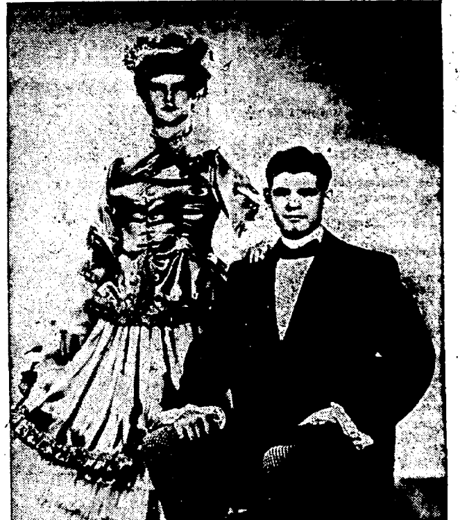
This distinguished looking couple is not always as dignified as the picture leads one to believe. The two really let their hair down in the University of Wisconsin Harefoot comedy, "Bloomer Girl." In fact, the "beauty" on the left takes hers off backstage between acts while catching a puff or two on a cigar.