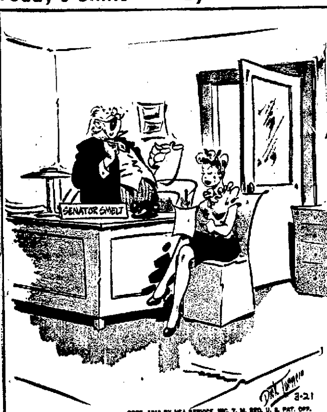
"Oh, yes—as to falling grain prices! Let's get out one joyous form letter to my livestock constituents, and one sad form letter to my corn and wheat constituents!"