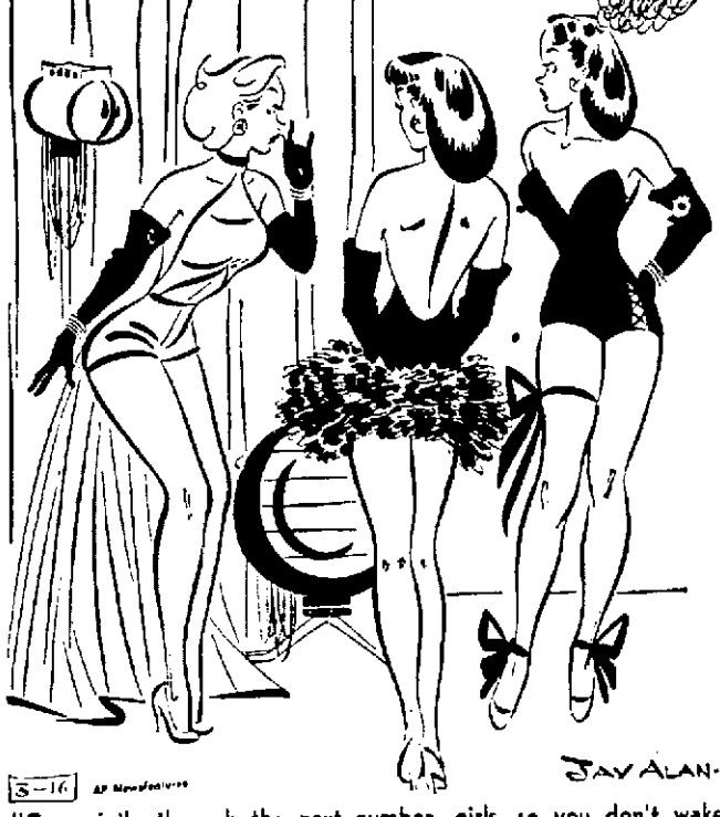
"Go quietly through the next number, girls, so you don't wake up the critics, they're all asleep!"

A. Technically, one does not skate on ice but rather upon a thin film of water which is melted from the ice by the pressure of the skates. Since no film whatever could exist between glass and the skate runner, and also since the glass is at least as hard as the blade, the skater could not get a "bite" with his blades with which to push himself forward.