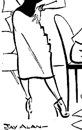
Now tomorrow you go right up there and tell your boss you want a raise like President Truman got that's tax exempt!