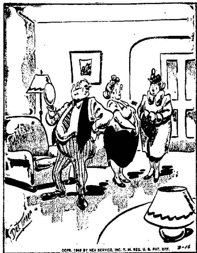
And you have the use of the house phone, provided you split all radio quiz prizes with the management!