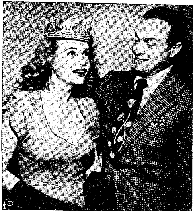
For her starring role on a radio network comedy program, actress Marie Wilson is crowned "Queen of Comedy for 1949" by Bob Hope, who is quite a gagster in his own right. The title was awarded in New York by National Laugh Week foundation.