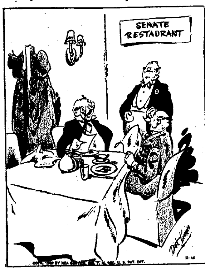
"The way you guys are getting appropriations, I'd think you'd pick up the check once in a while!"