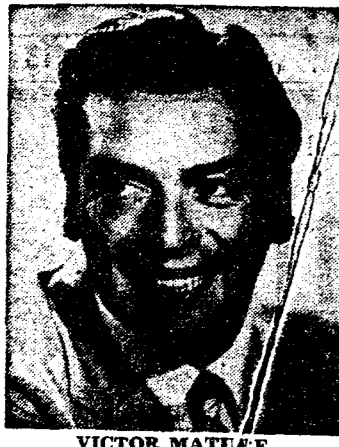
VICTOR MATURE WIBA at 9 p. m.