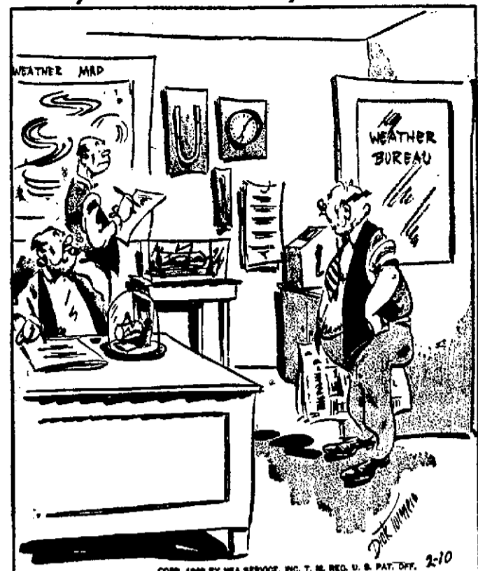
"With all the gloomy news in the papers, I'd think you fellows could predict a pleasant day more often!"