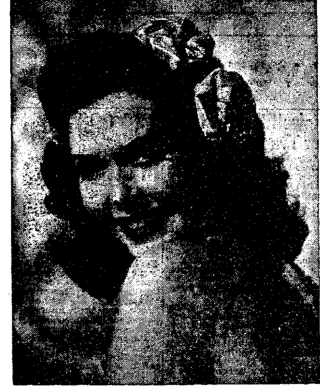
Ann Miller wears halo-ettes, Hollywood's newest fashion idea on a charming headgear to match any type of costume. The dancing star says they are lovely to look at, easy to wear, and can be adjusted in many intriguing ways.