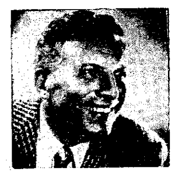
EZIO PINZA WIBA at 7:30