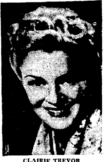
CLAIRE TREVOR WIBA at 9

and Doak Walker of Southern Methodist university.